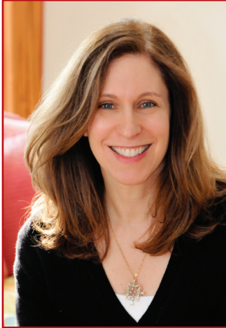
Author Lauren Tarshis

When I first had the idea for the I Survived series I thought, great—I'll whip these books out in no time. I'd already written nonfiction articles on many of the topics. I have four kids, and I figured that they and their friends could be the inspiration for the fictional characters that would star in each story.